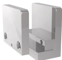
PANEL GRIP 2 RAILING SYSTEM