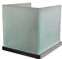
3M GLUE OR SILICONE