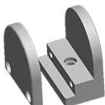
STAINLESS STEEL GLASS CLIP PANEL MOUNT For 1/2" Panel