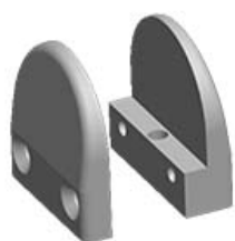
STAINLESS STEEL GLASS CLIP PANEL MOUNT For 3/8" Panel